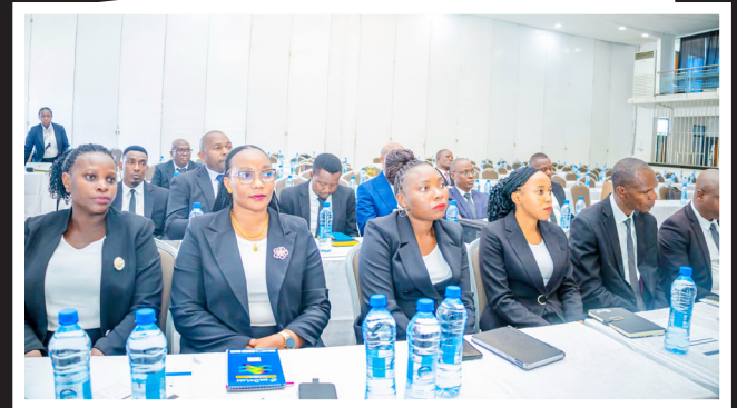
Some of the staff recently transferred to the Office of the Attorney General attentively follow presentations during a briefing session led by the Deputy Attorney General, Hon. Samwel Maneno, in Dodoma.